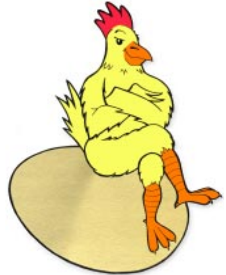
Geese aren't the only ones TM that can lay golden eggs

No. This product does not contain any growth hormones, bacteria, or live products. It is a natural enzyme-based water additive. Enzymes act as catalysts to make other processes function more efficiently. CI 3-4 Poultry is not only safe, it has no residual carryover.